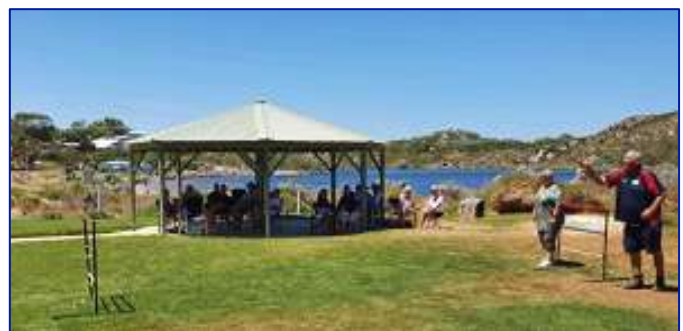
Watching Ladder Golf under the gazebo