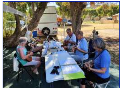
Our ukulele group practicing.

Saturday and our van site overlooks the Moore River. How beautiful to watch the pelicans on the river. The kids dragging kayaks, paddle boards etc down to the water. A rustic little park but a great place to unwind.