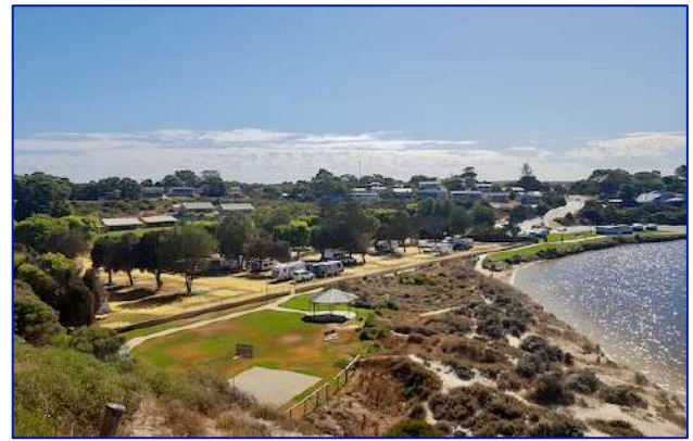
Caravan park and Gazebo from the lookout