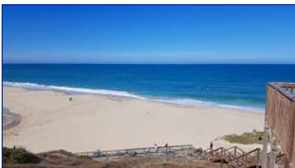
Stunning views of the walkers on the beach.