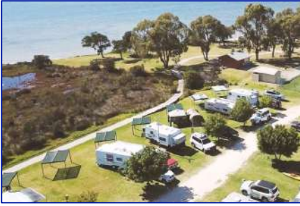
Miami Holiday Park

Miami Holiday Park 627 Old Coast Road, Falcon – 9534 2127